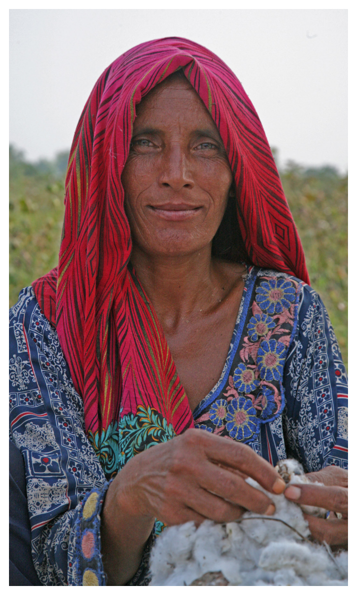
Image: A cotton picker in Punjab, Pakistan, by Rajeshree Sisodia/PRISE