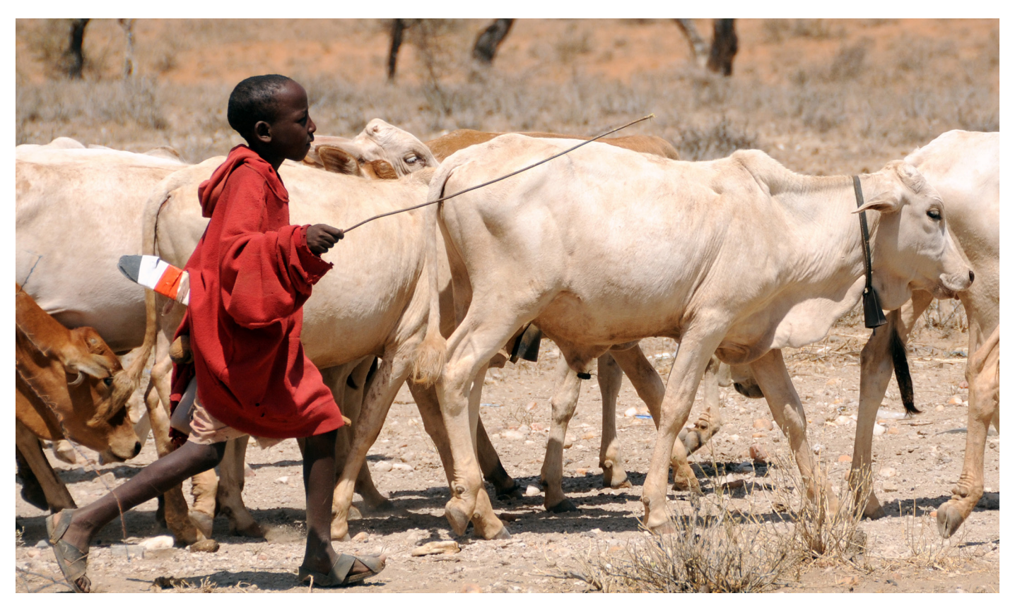
Image: Samburu boy herding cattle in Kenya

Sources: <u>Jobbins et al., 2016</u>; <u>Carabine and Simonet, 2018</u>; <u>ICARDA</u>; <u>UNDP</u>