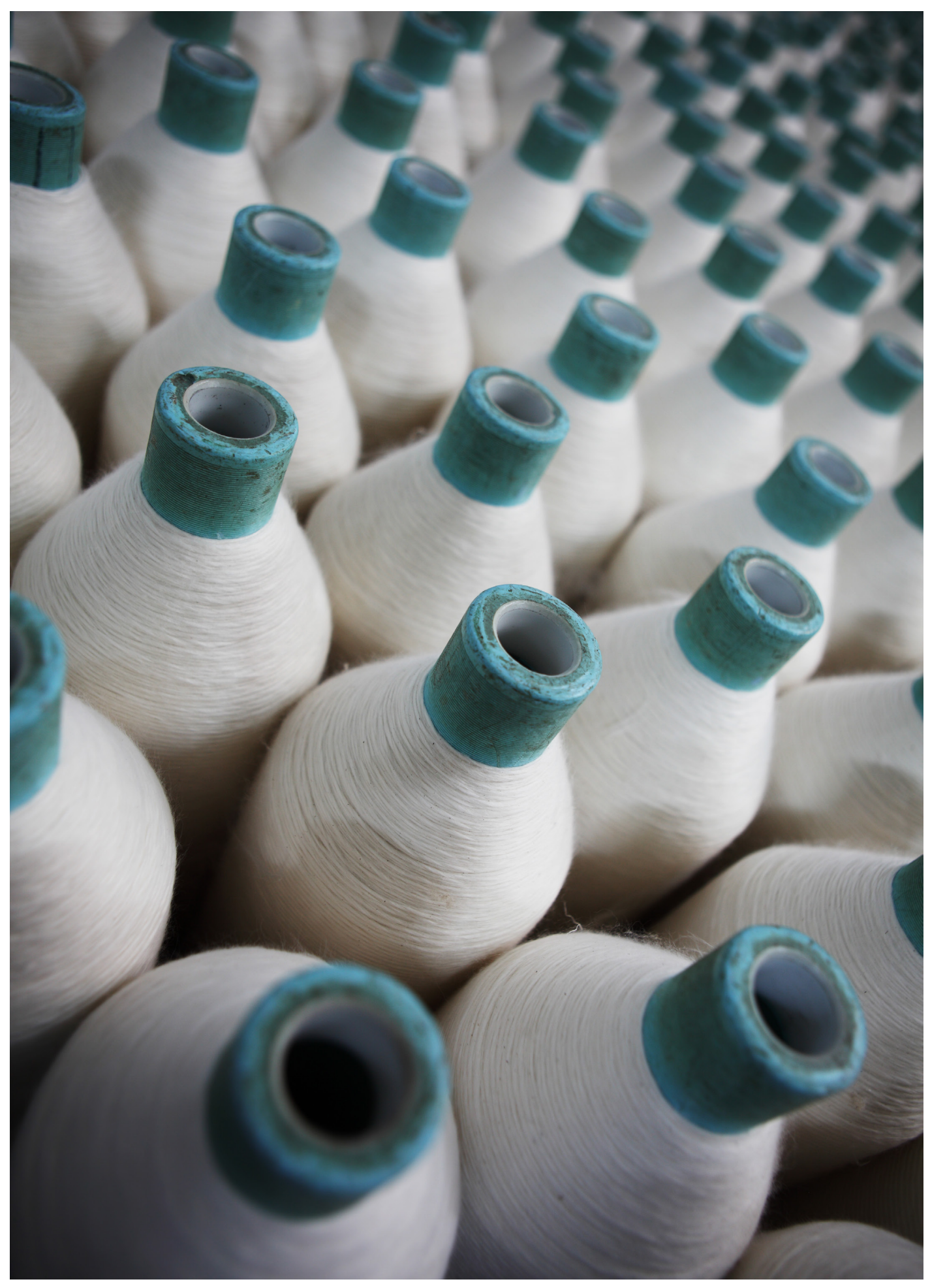
Image: iStock.com/Textile industry – cotton spools spinning thread, by Danish Khan Cover image: iStock.com/African woman from Samburu tribe, Kenya, by Bartosz Hadyniak