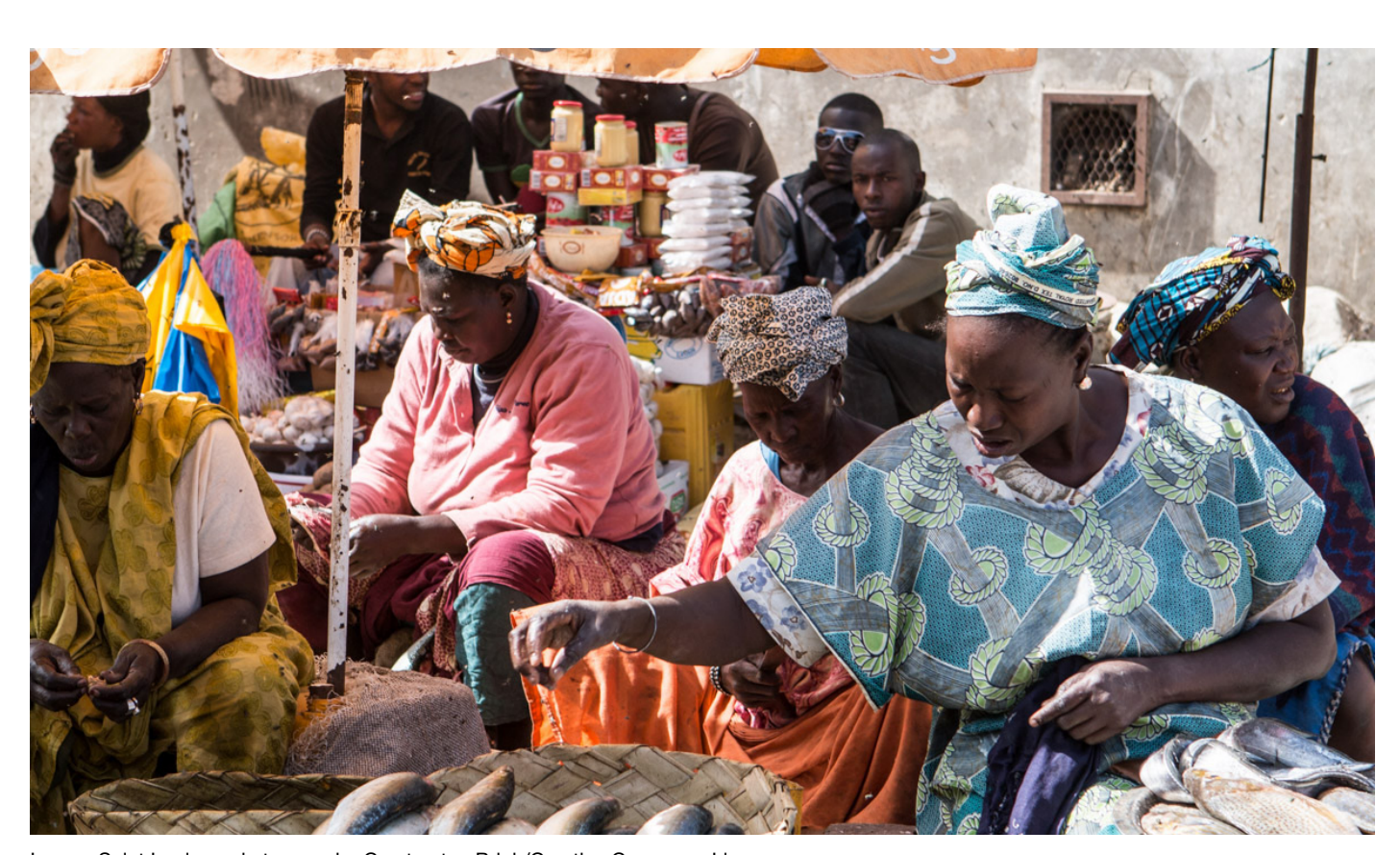
Image: Saint Louis market scene