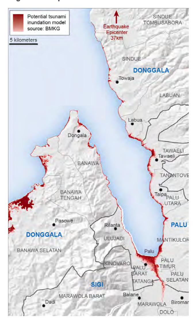
Figure 1: Map of affected area

Although the Sulawesi response was tied to the response in Lombok, the focus of this paper is limited to Sulawesi due to restricted resources and capacity for this case study, as well as the absence of international organisations in Lombok compared to Central Sulawesi. A few interviews were completed with actors who had worked either in Lombok or in both responses. Another limitation was the inclusion of fewer interviews with the Red Cross Red Crescent Movement than desired due to the emerging Covid-19 outbreak at the time of the fieldwork (February 2020).