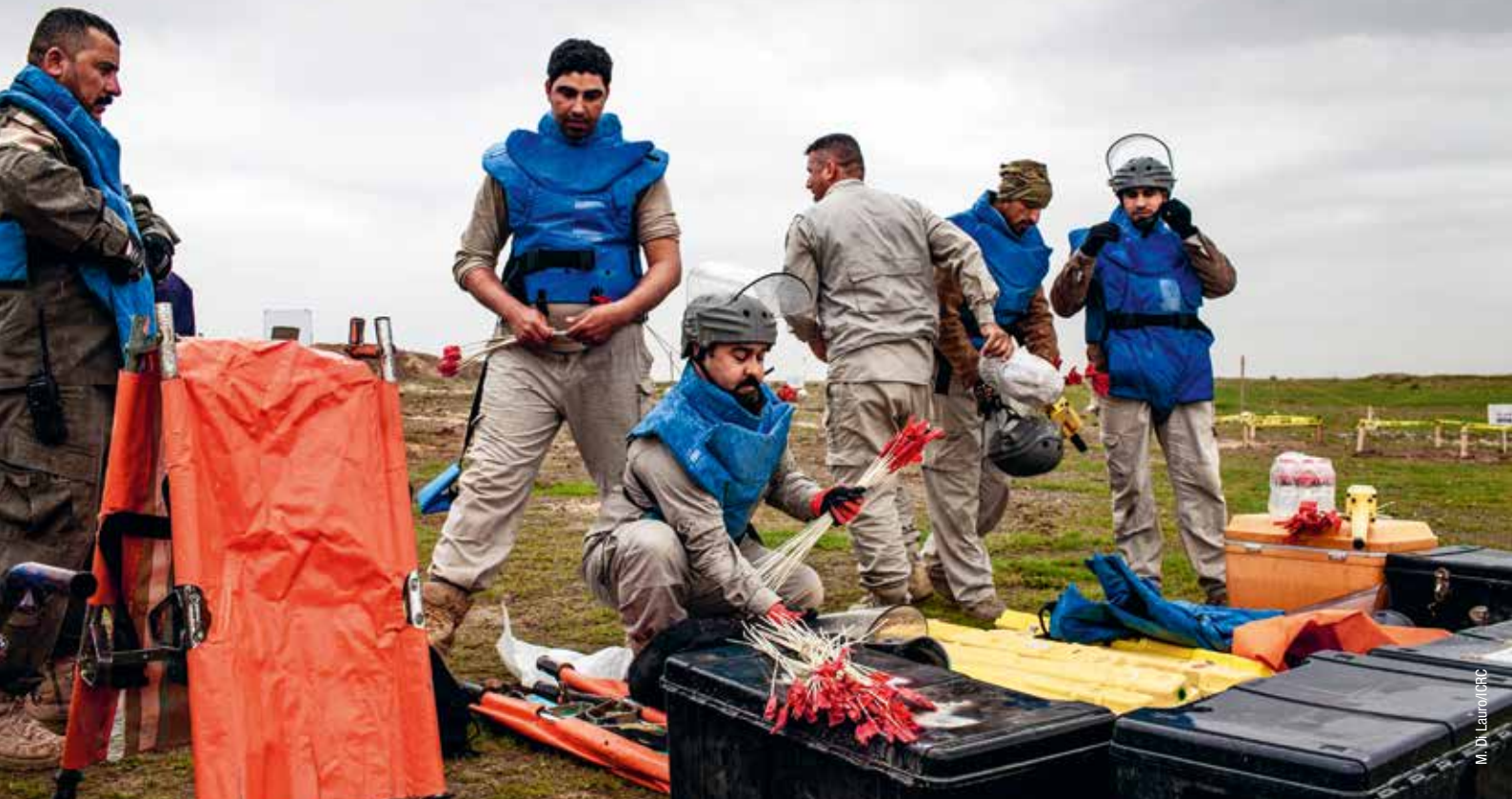
Iraqi Mine Clearance Organization deminers pack up their equipment after practising clearance procedures.