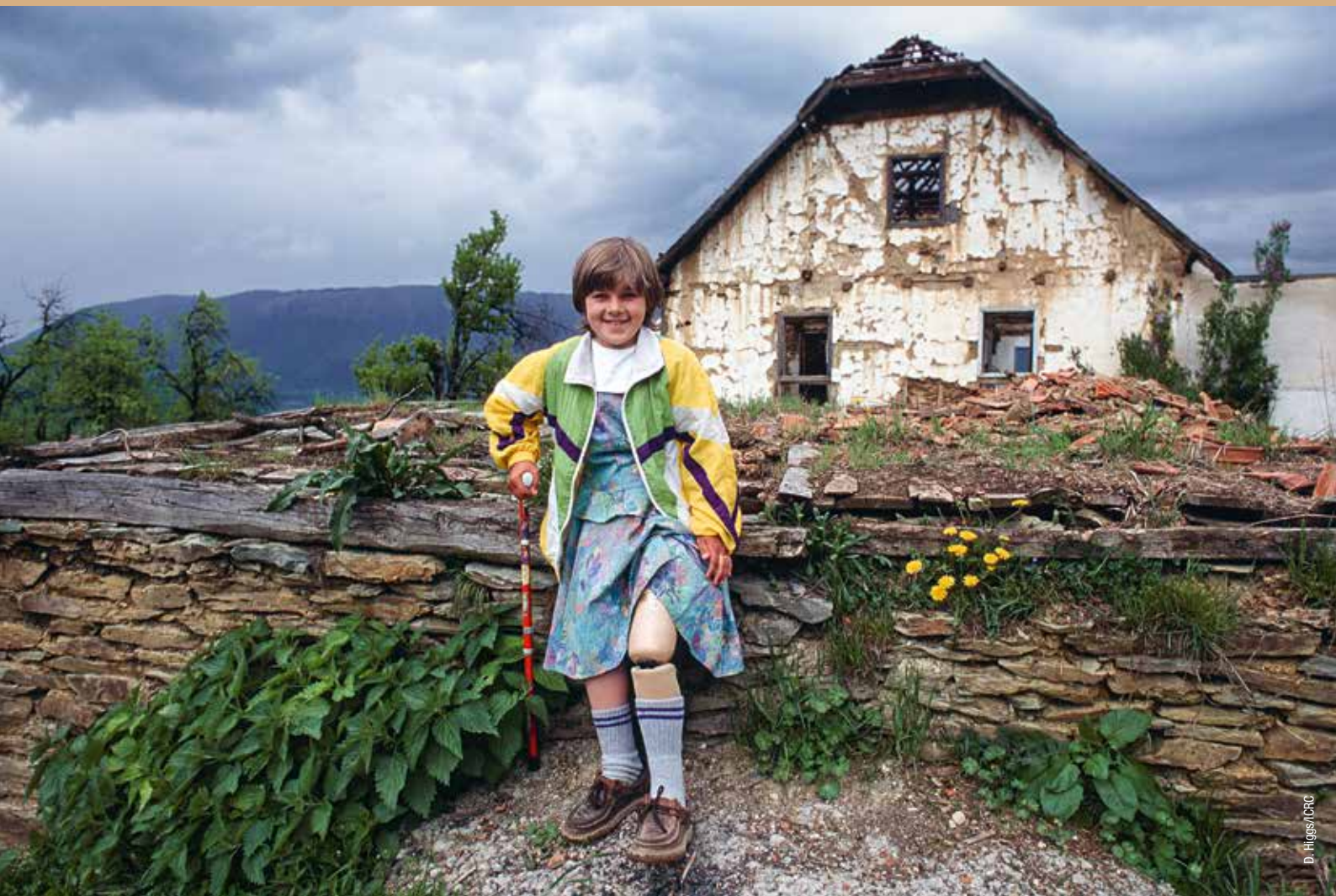
A victim of an anti-personnel mine in Bosnia-Herzegovina

Achieving these objectives will be possible thanks to the remarkable partnership between States, international organizations and civil society which led to the adoption of the Convention 20 years ago and has been instrumental in the Convention’s success until now. This partnership must continue to be the foundation of all future efforts to rid the world of anti-personnel mines once and for all.