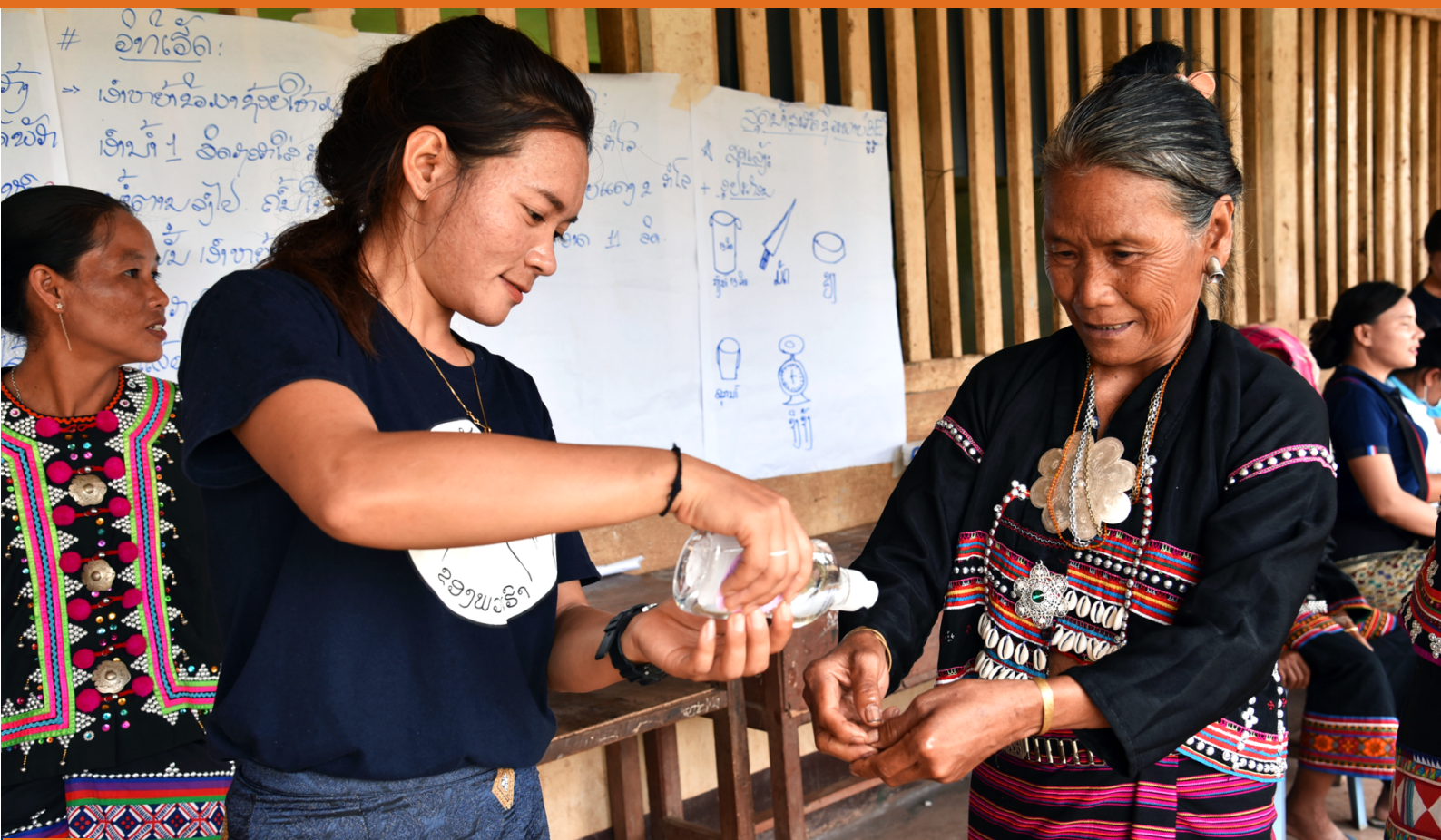
CARE staff and programme participants take sanitary precautions.