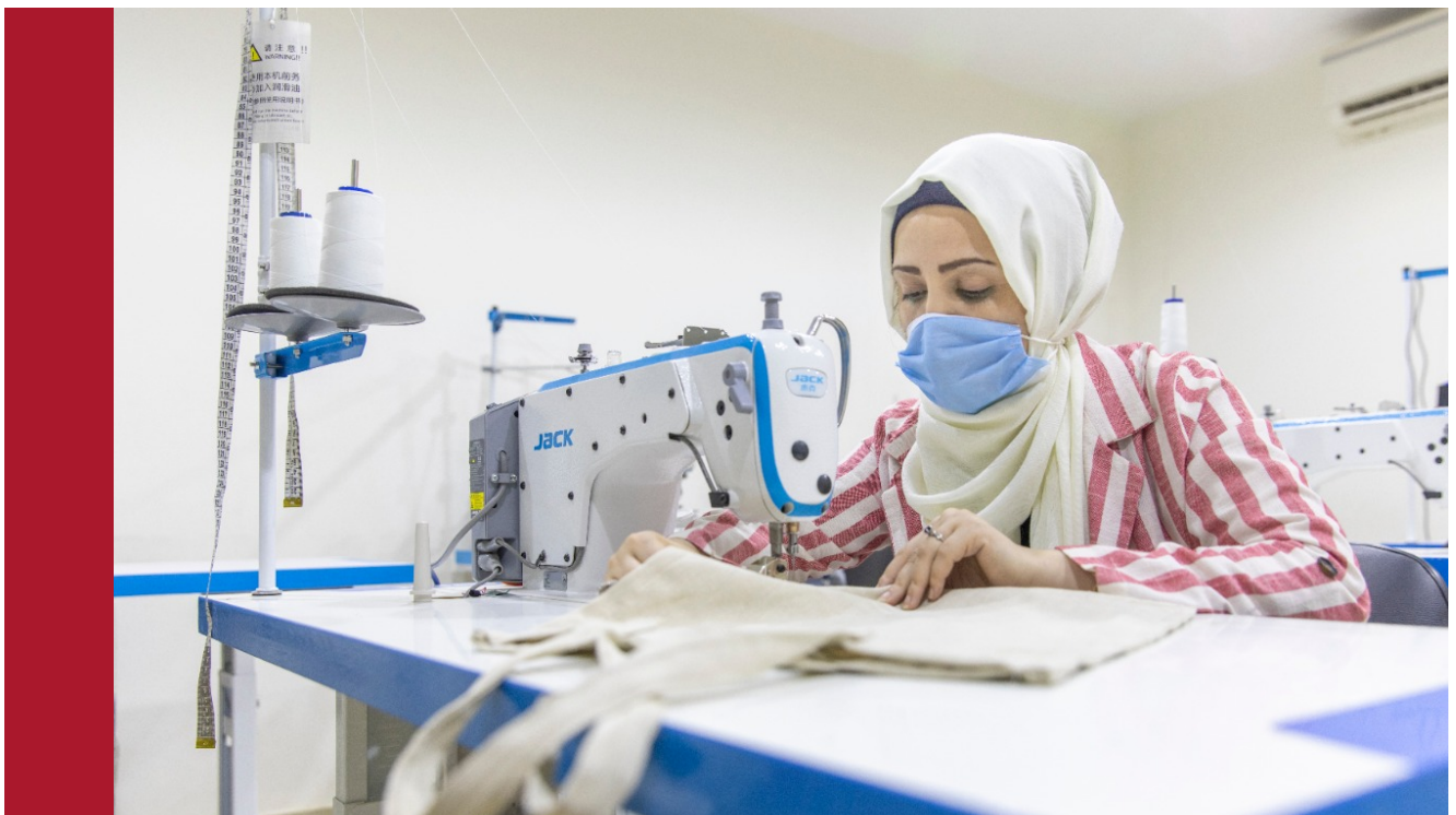
A Syrian woman refugee sews hygiene kit bags as part of the UNFPA-funded project "Girls and Women Safe Spaces for Refugees, Asylum Seekers, Migrants and Host Communities."

Women's entrepreneurship is a precarious form of work: women entrepreneurs often lack health insurance, access to retirement provisions 84 and other public provisions. If they lose their livelihood, the risk of falling into poverty is high. Even when women grow their businesses, moving marginally above the poverty line 85 can unintentionally deny them access to the support mechanisms, such as subsidies, that they need to keep their business afloat. For example, women entrepreneurs in Peru, who had been able to move out of extreme poverty over the course of a three-year project, found themselves in a new 'missing middle' when COVID-19 started to