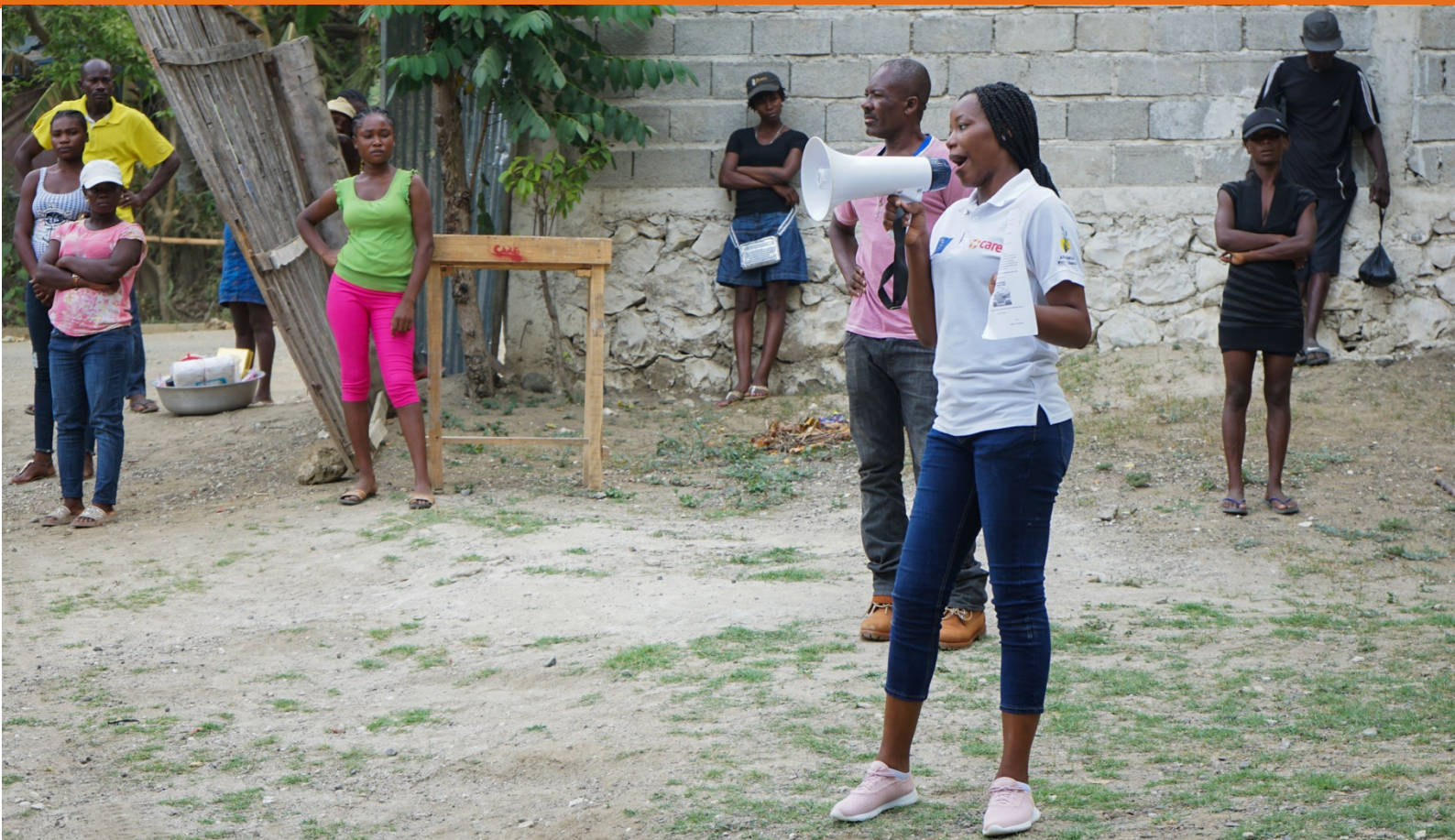
A CARE staff member gives instructions during the distribution of hygiene kits in Haiti in response to COVID-19.