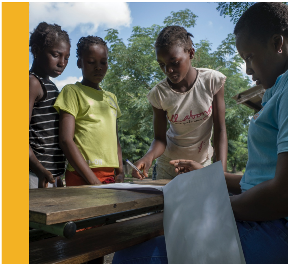
Girls participate in CARE’s response to cyclone Idai in Mozambique.

These findings demonstrate that the first generation of COVID-19 recovery packages put forward by major economies risk further accelerating the climate crisis . Yet there is one optimistic element: the EU recently made significant steps towards increasing its emission reduction target for 2030, from at least 40% to at least 55%. The driving forces behind this change, including the European Parliament and the European Commission (which is backed by more than 170 business leaders), justify this as an ‘investment plan for a true recovery’. 126 Although even greater cuts are required to comply with the Paris Agreement, this move signals a step forward, and one that may encourage others to step up as well. 127