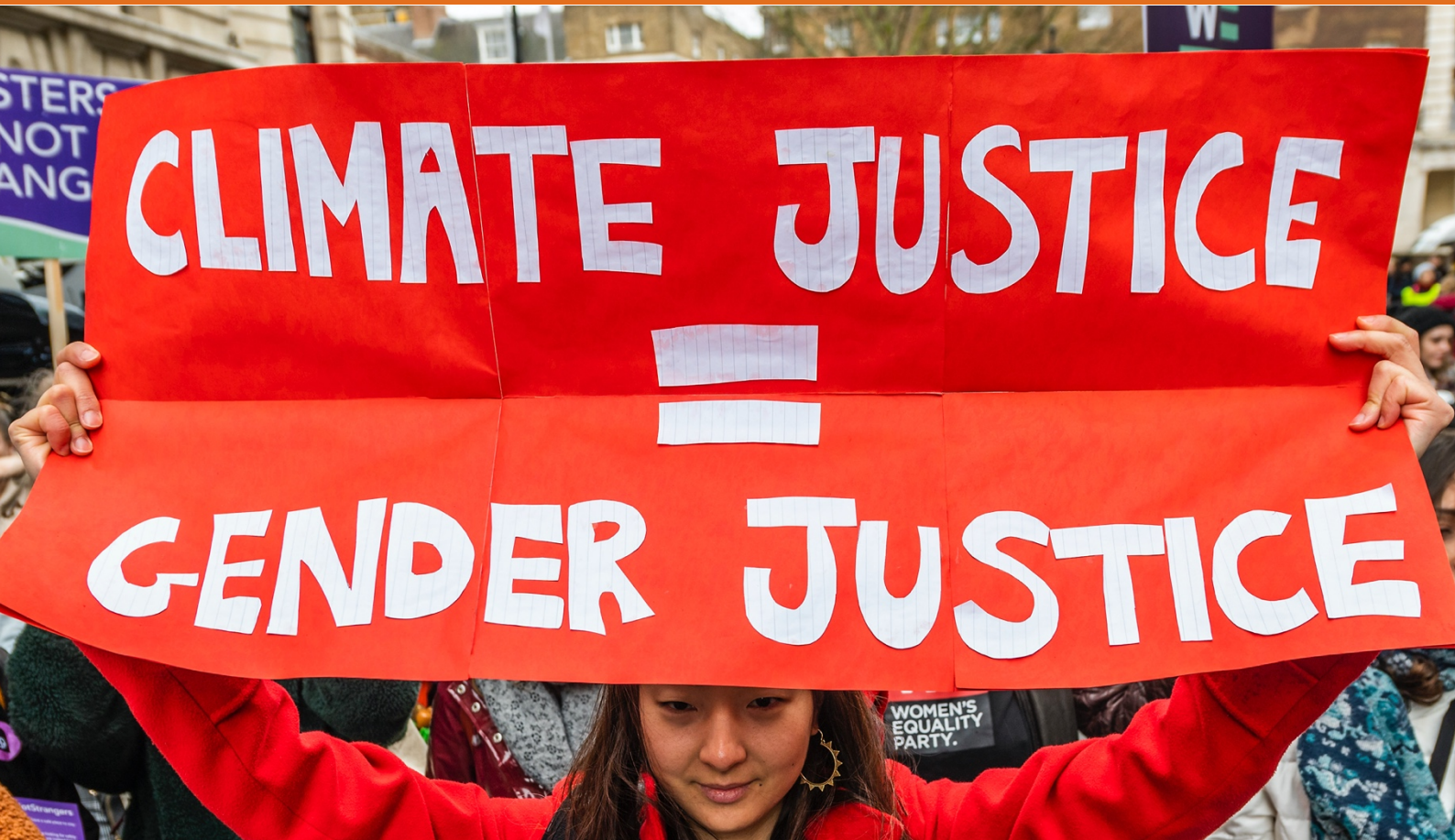
People march at the #March4Women march for gender equality and climate justice in London on International Women's Day, 8 March 2020.