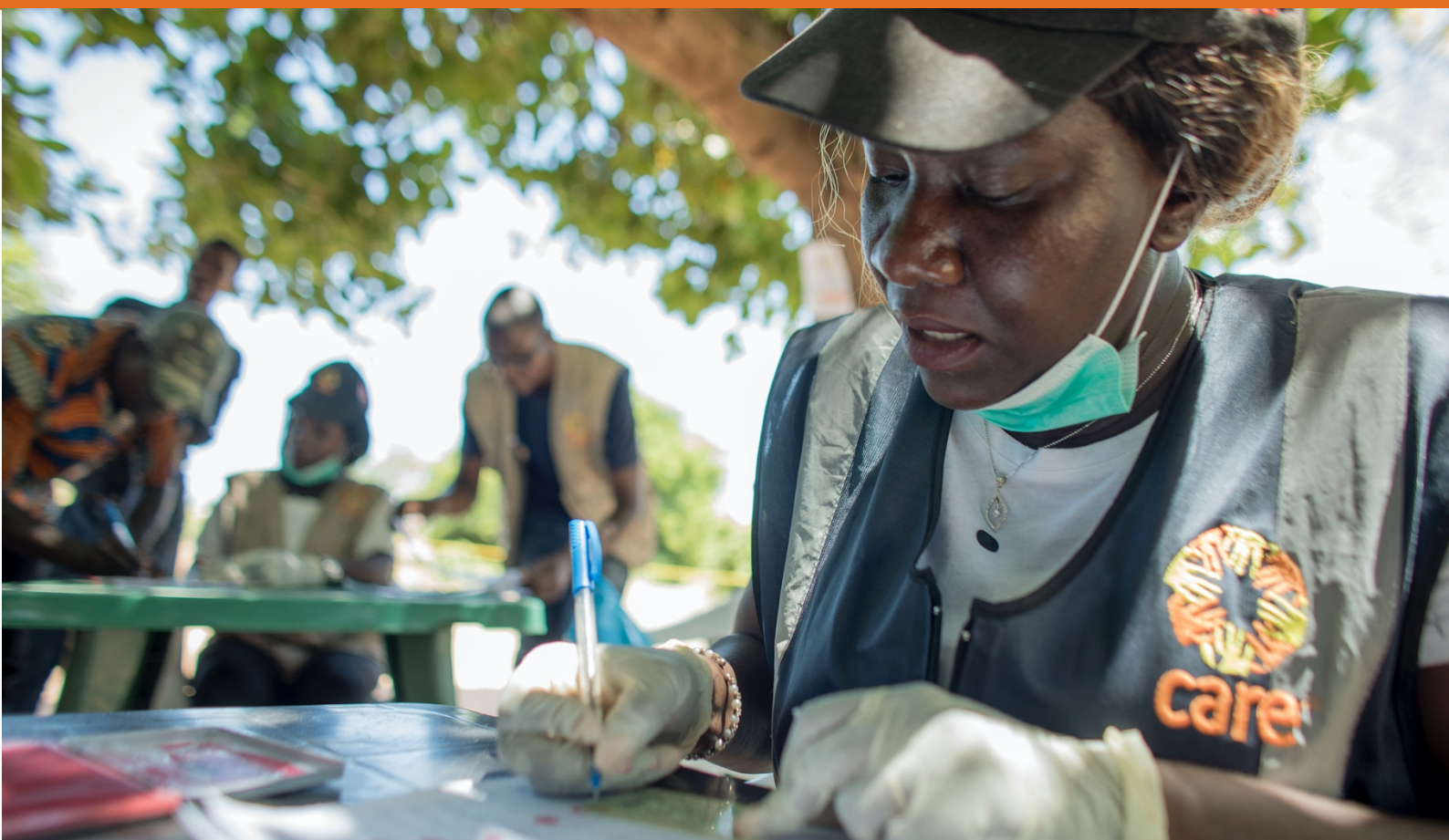
CARE staff at work in Mozambique.