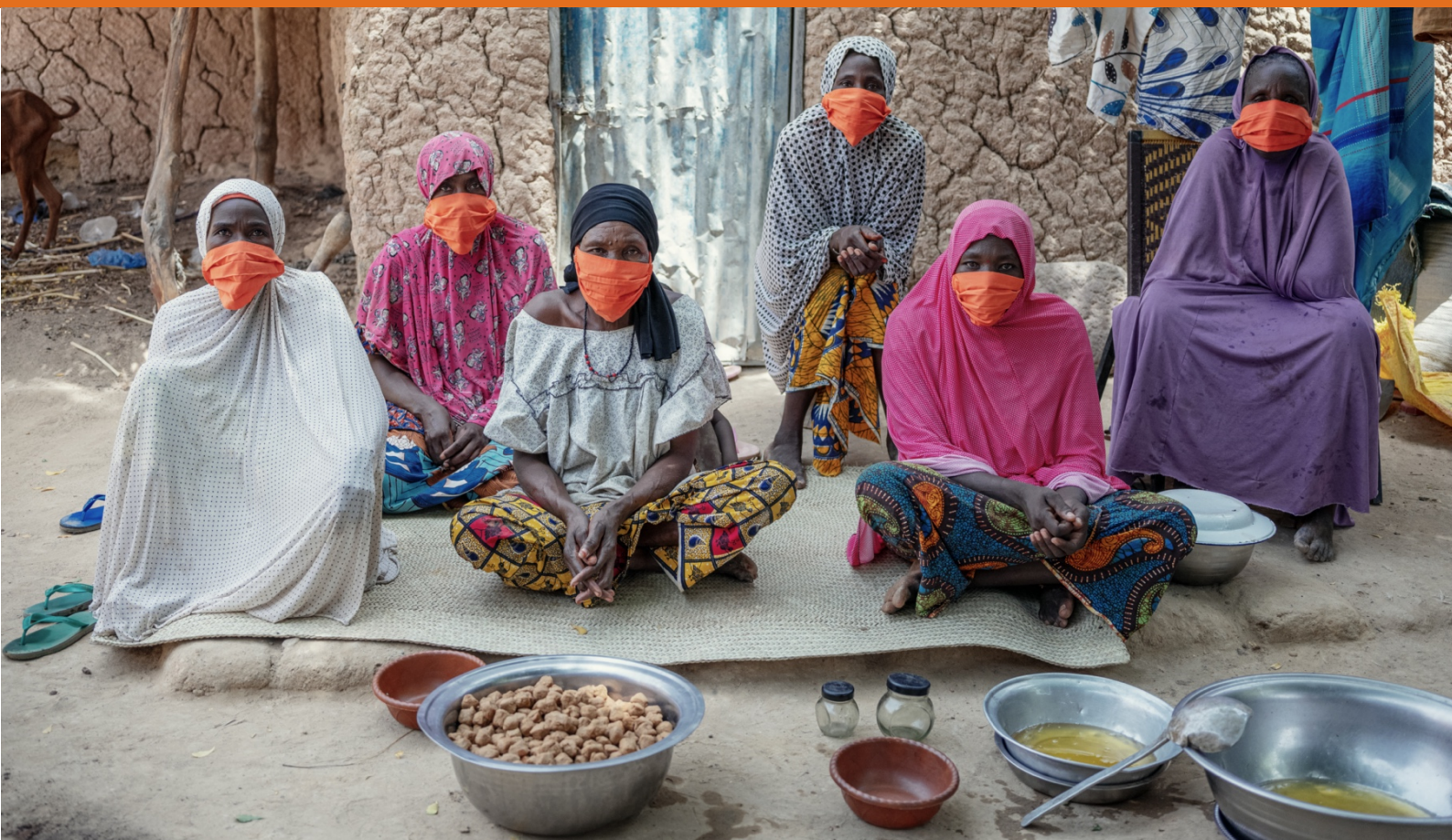
Women VSLA participants in Rafa, Niger participate in peanut processing. COVID-19 has affected the women's livelihoods and their ability to provide food for their families.