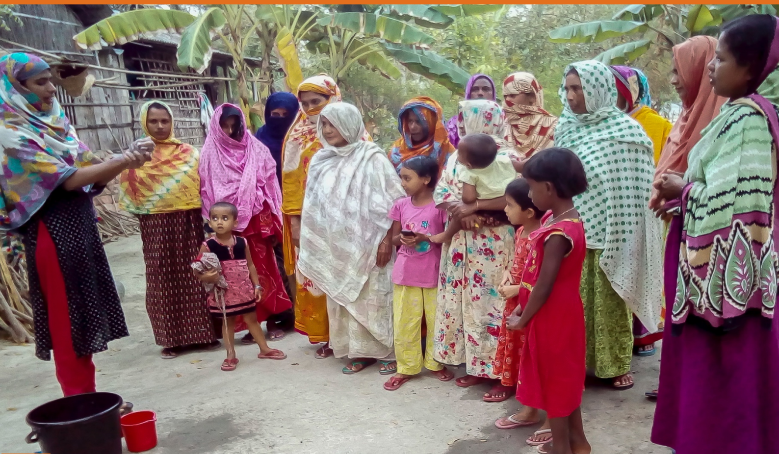
A woman demonstrates handwashing practices in Satkhira, Bangladesh, as part of CARE's COVID-19 response programming.