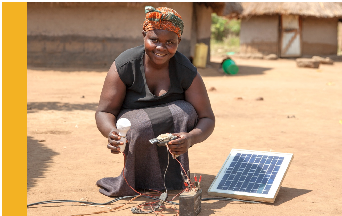
A woman in northern Uganda uses solar energy to charge her cell phone.

the government and development partners to jointly encourage people to embrace diversification of alternative energy sources to reduce wood use, making a plea to outlaw adverse methods of charcoal production and unlicensed charcoal burning. 149 However, the COVID-19 response in the food and agriculture sector lacks sufficient attention to women's needs, rights and leadership in this regard. 150