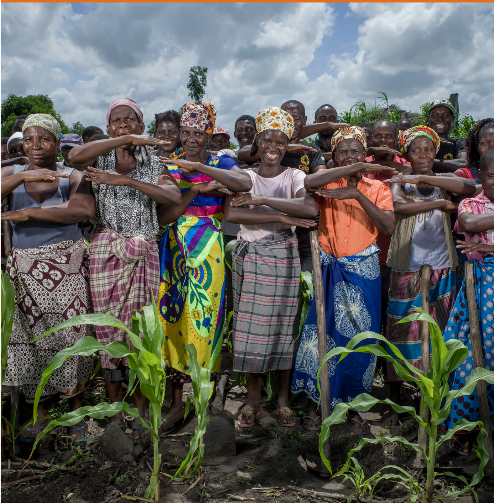
Farmers and CARE staff at a seed distribution in Mozambique.

Building Forward: Creating a More Equitable, Gender-Just, Inclusive, and Sustainable World