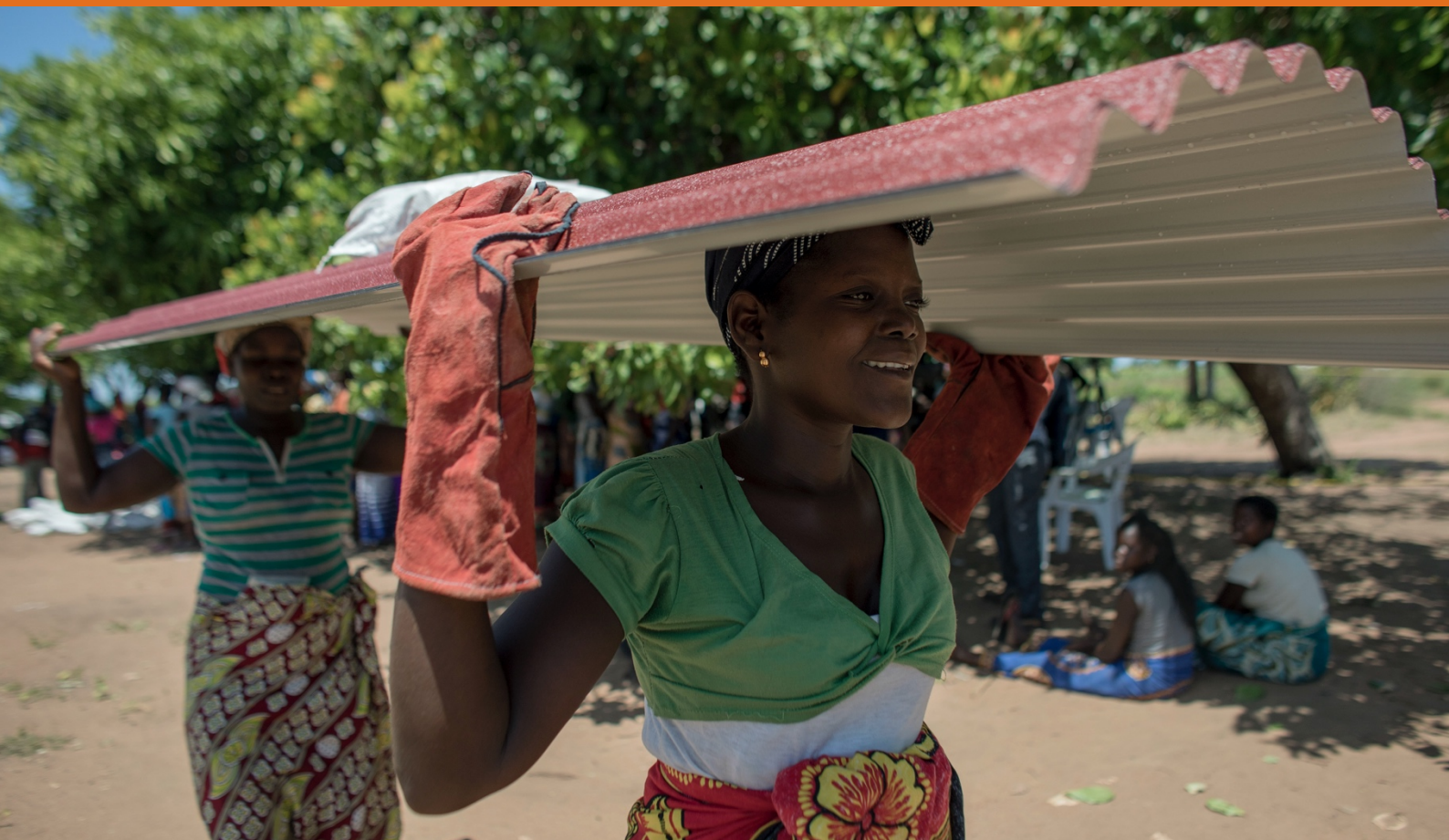
Women transport a CARE-provided shelter kit in Mozambique.