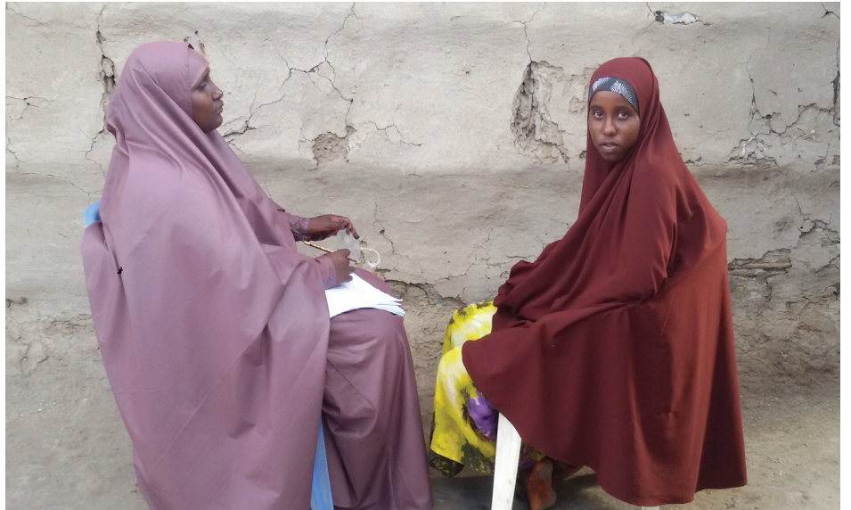
Interview with an adolescent girl who is out of school.

Data analysis was led by Adeso using an inductive approach and RQDA software for coding and analysis. FGD responses across sub-populations were combined and analyzed first by district, then by village, and lastly by livelihood group.<sup>1</sup> Interview responses were then analyzed using the same approach. FGD and KII responses were then triangulated.