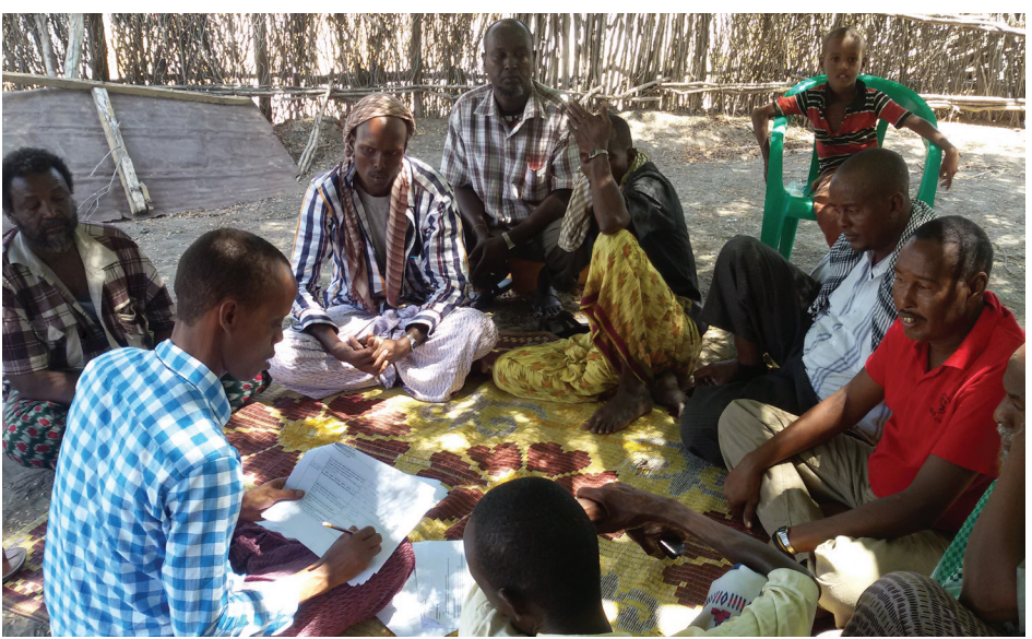
Focus group discussion with men.