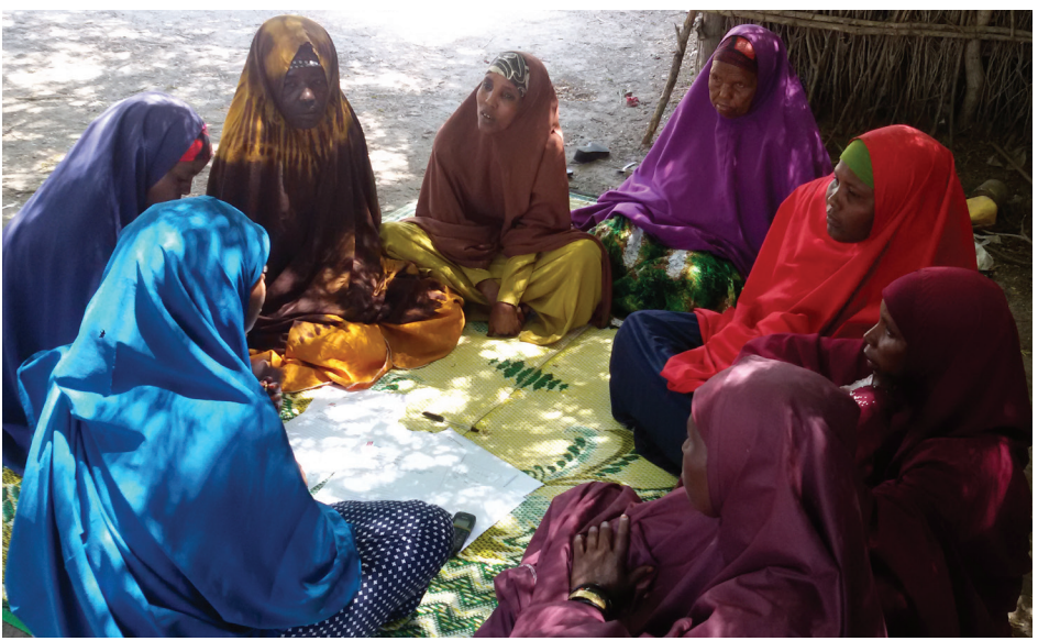
Focus group discussion with elderly women.