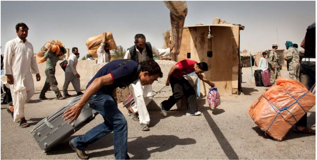
Afghans returning from Iran, at the Islam Qala border crossing with Herat province.