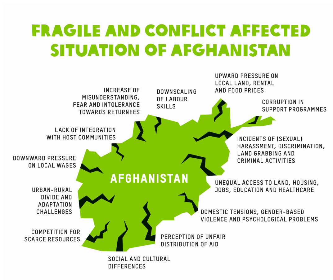
Figure 3: Potential pressure points affecting Afghanistan from returnees and host communities

It is clear that returnees are returning to a highly fragile situation, especially in Kunduz and Nangarhar. While there is currently little evidence that it is fuelling structural instability, insecurity or conflict, it is evident that the returnees are putting pressure on scarce resources and many are concerned that Afghanistan has reached the limit of its absorption capacity. Additional pressure is building up where other sources of friction are already creating and increasing vulnerabilities.